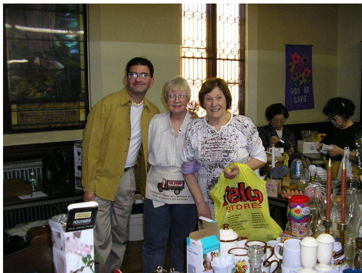
Members of New Utrecht Reformed Church.